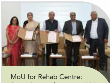
MoU for Rehab Centre: Signed on 16th January 2024 with Jaya Foundation.