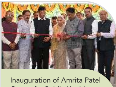
Inauguration of Amrita Patel Centre for Public Health on 2nd September 2023.