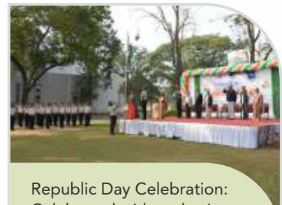
Republic Day Celebration: Celebrated with enthusiasm on the 75th Republic Day.