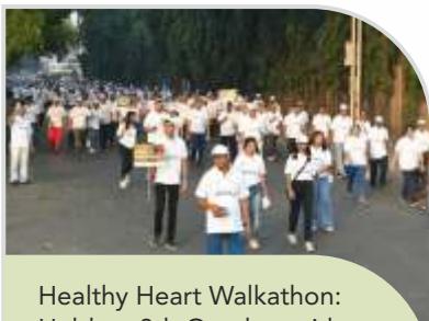
Healthy Heart Walkathon: Held on 8th October with over 2500 participants.