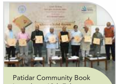
Patidar Community Book Launch on 18th February 2024.